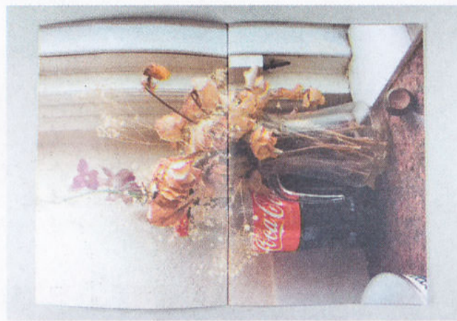
13 PRESTON IS MY PARIS