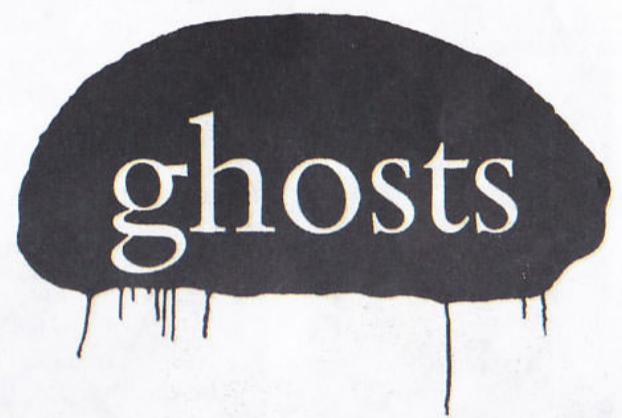
14 GAGOSIAN'S FLASH FLASH FLASH: DOUGLAS GORDON