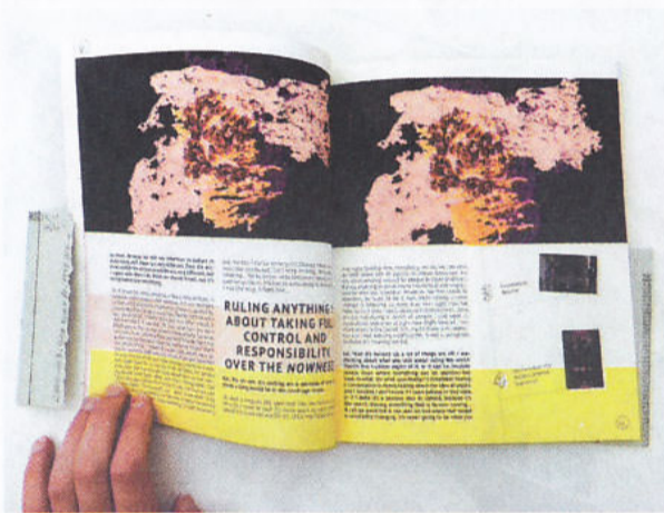
12 PRESS PRESS